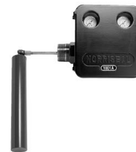
Electric Level Displacer

Low Pressure systems can have difficulty operating classic pressure level switches. The Solar Dump Controller operates an electric motorized dump valve when signalled by the electric separator level switch.