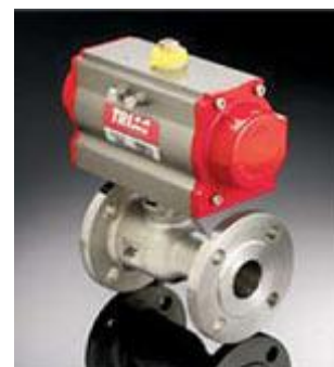
12 volt DC Valve Actuator